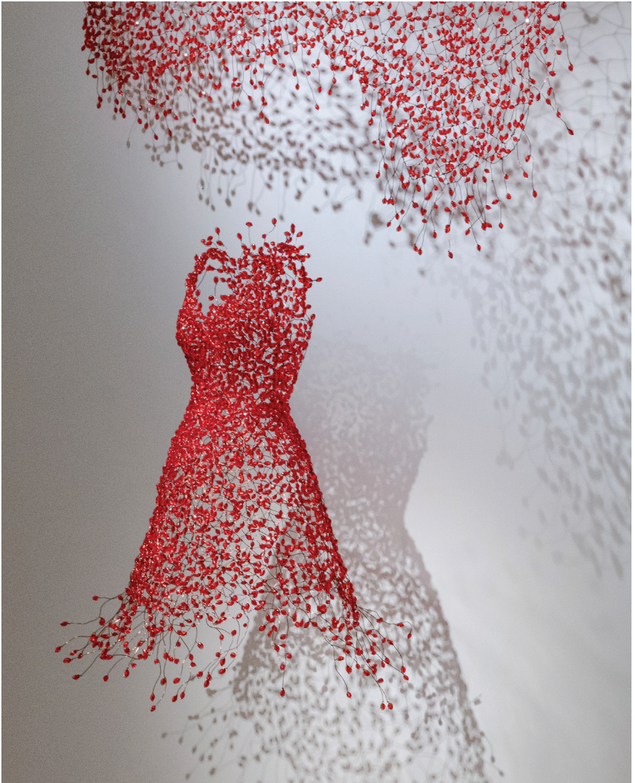
Enlightenment in Red , red wire, red beads

Dress 44" x 34" x 20" (Installation element) 42" x 74"