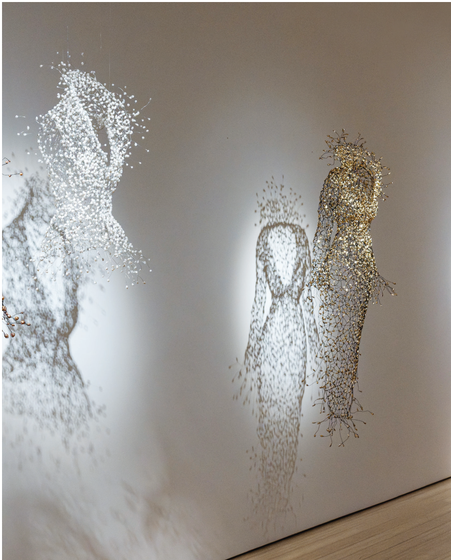
Enlightenment in White Pearls , wire and pearls, 31" x 21" x 11"