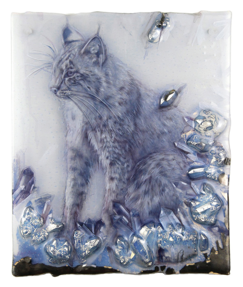
King, kiln formed glass, engraved, painted, silvered, 20" x 18"