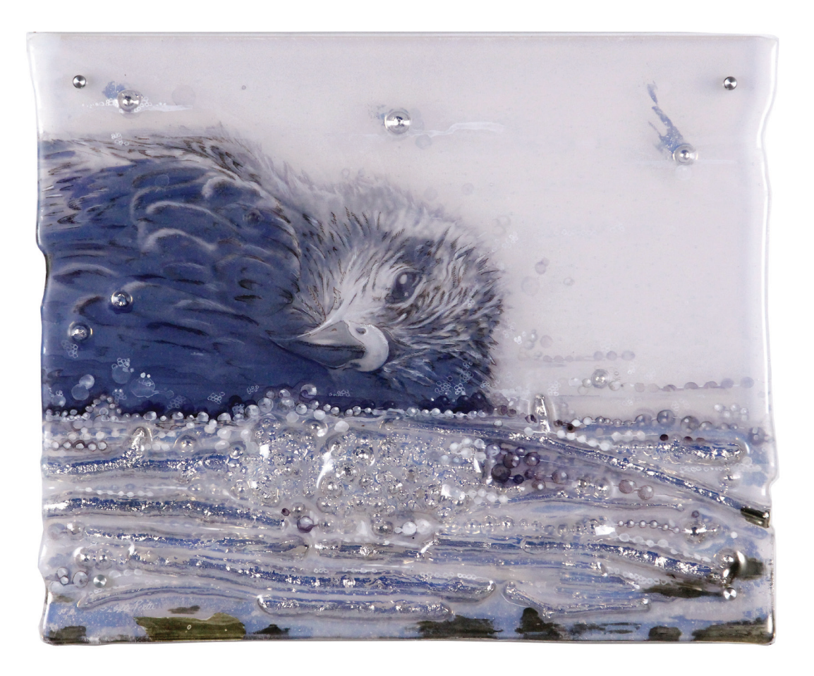
Floating Kite, 2024, kiln formed glass, engraved, painted, silvered, paper applique, 17" x 21"