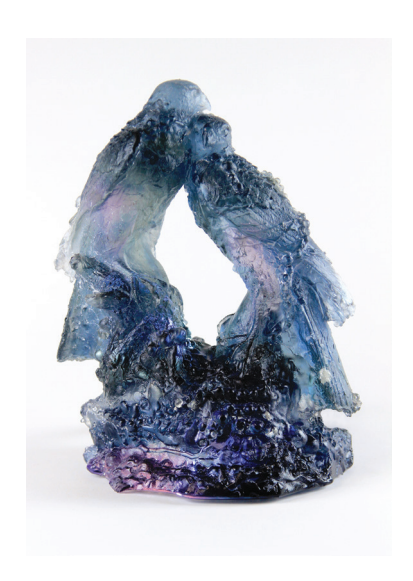
Lovers in Blue, 2024 cast glass, 12" x 10" x 8"

ARTWORK © SIBYLLE PERETTI 2024 CATALOG © CALLAN CONTEMPORARY 2024