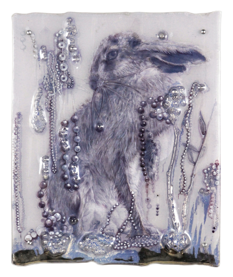
Opal , kiln formed glass, engraved, painted, silvered, 21" x 17"