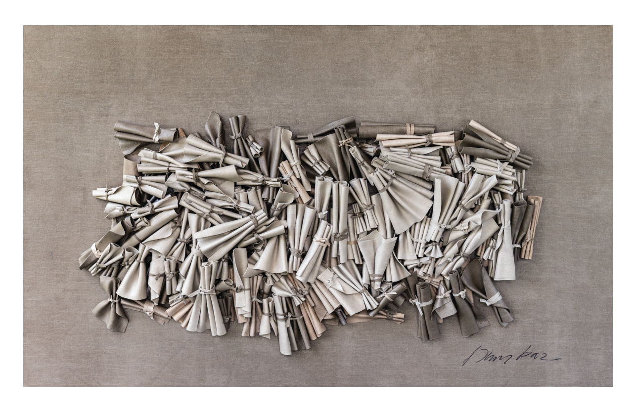
Paquet Series XIV 2023, yarn dyed linen bundles on linen canvas, 48" x 78"