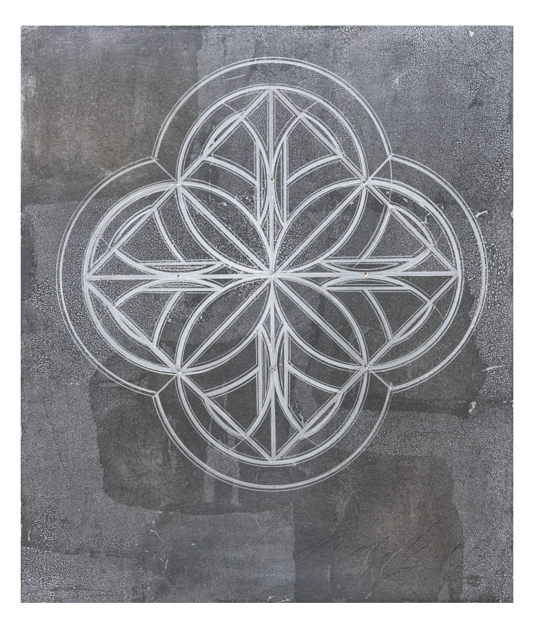
Coin Du Lestin CCVII 2023, Asian leaf over gray clay, 14" x 12"