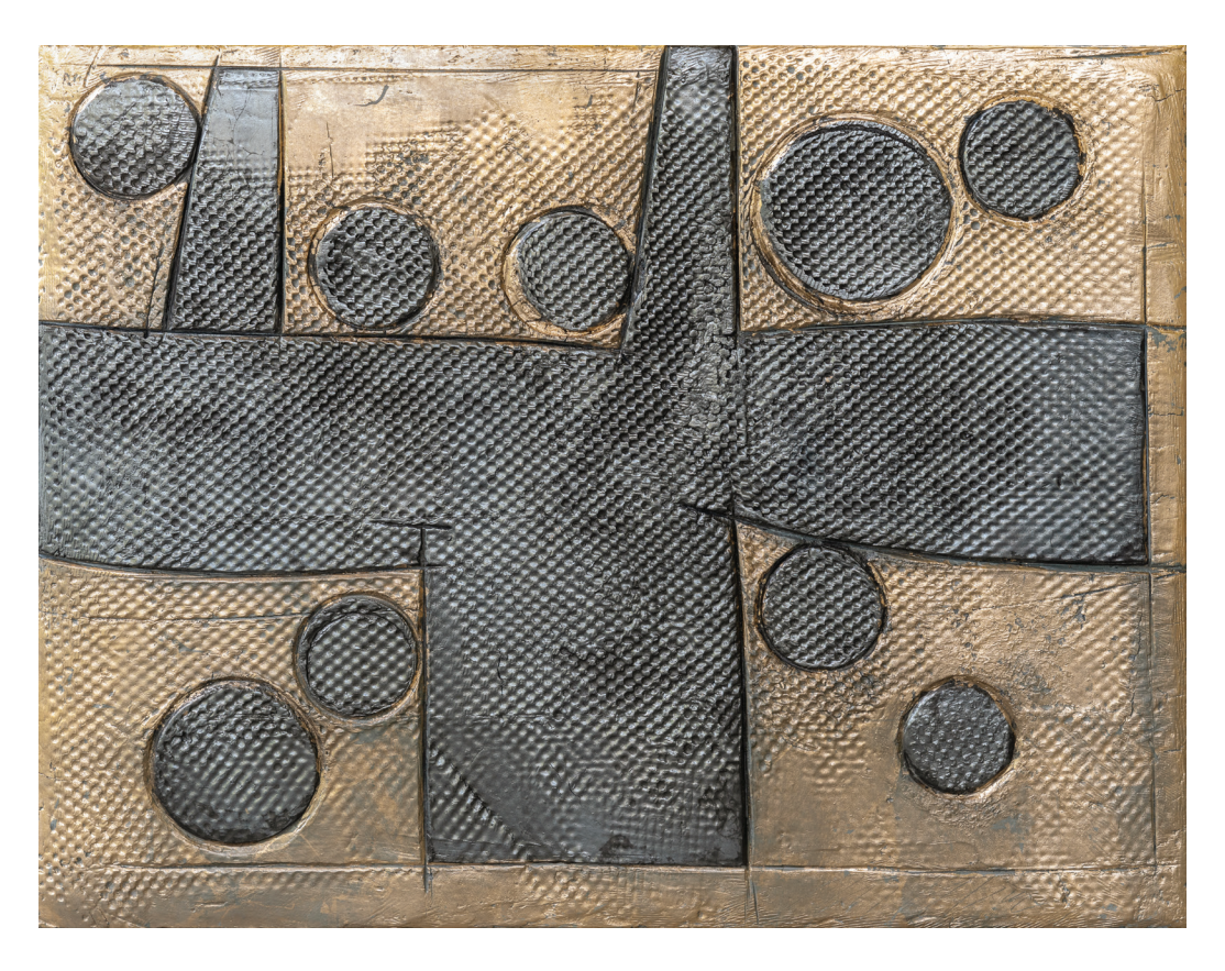
Bonfouca XCVII 2023, Asian and Moon gold leaf over gray clay, 19" x 24"