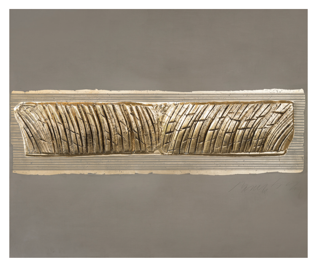
Tuxachenie - Surge Series 2023, Moon gold leaf over clay, 33.5" x 40"