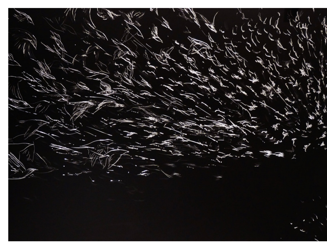
Murmuration, Rome 2015 incised, painted aluminum, 44" x 115"