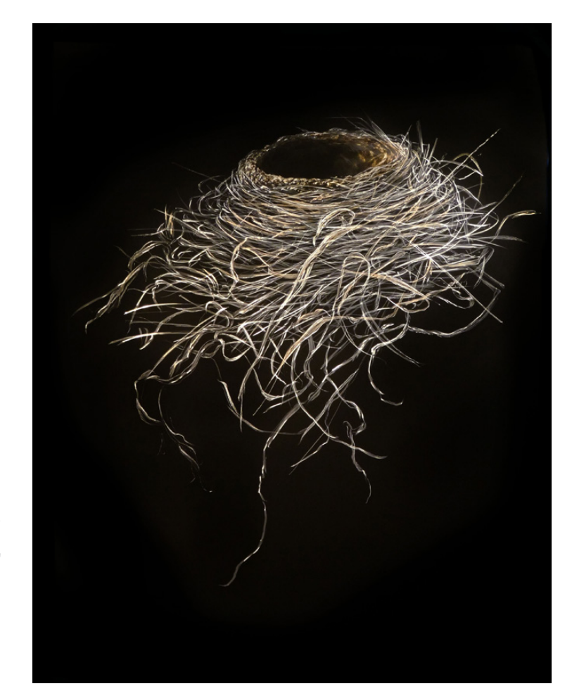
Sanctuary, 2016 incised, painted aluminum 59" x 47"