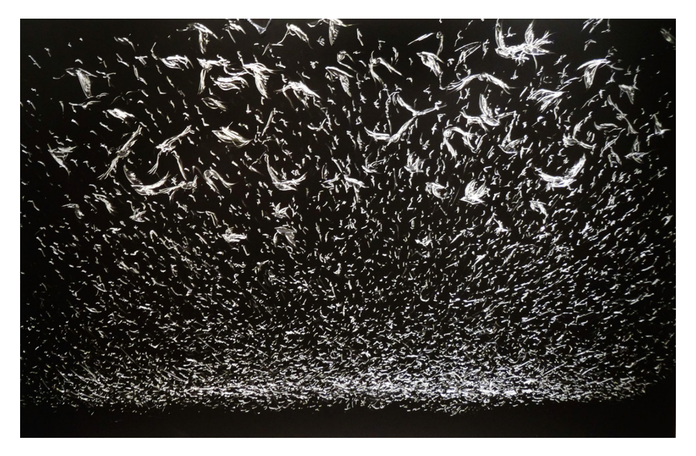
Murmuration, 2016 incised, painted aluminum, 47" x 73"